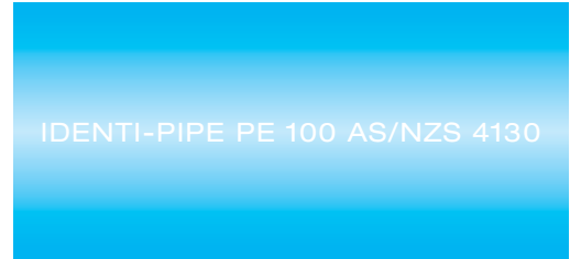
Drinking / Potable Water