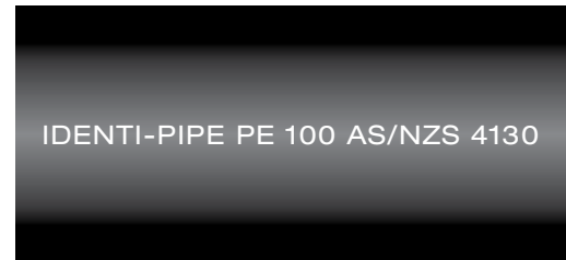
Non-Potable / Sewer