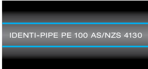
Drinking / Potable Water